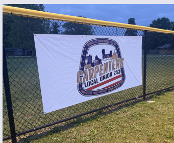
Pictured: Sponsorship outfield Sign in Homer.

Baseball and softball season is in full swing across our communities, and Carpenters Local 243 is proud to sponsor local programs that bring communities together and help teach teamwork, dedication, and sportsmanship.